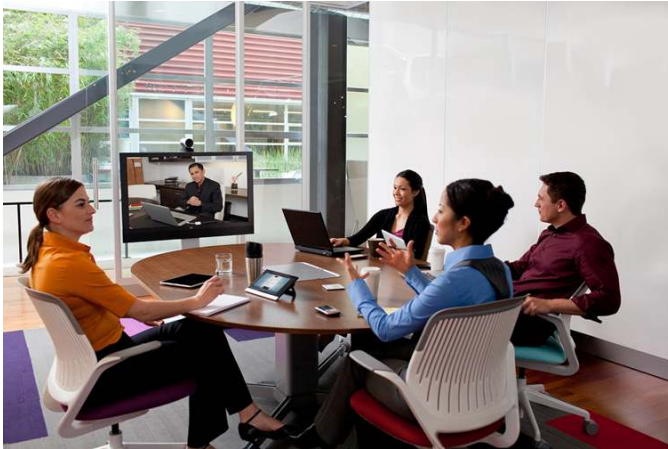
Figure 3. Cisco TelePresence MX300 in Medium Team Room Environment