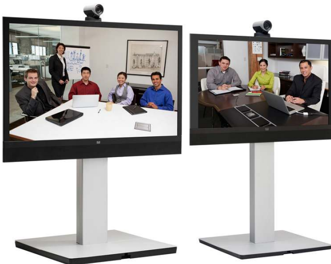
Figure 1. Cisco TelePresence MX300 and MX200 on Floor Stand

Installed in approximately 15 minutes, the Cisco TelePresence MX200 and MX300 endpoints reinvent the team meeting room experience. The systems offer the high-quality, easy-to-use telepresence experience that you have come to expect from Cisco, combined with simple installation, global service, and a price performance that makes broad deployment easier and more affordable than ever.