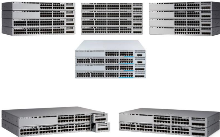
Figure 1. Cisco Catalyst 9200 Series switches

The Cisco Catalyst 9200 Series is made up of modular (C9200), fixed (C9200L) and compact (C9200CX) switch models.