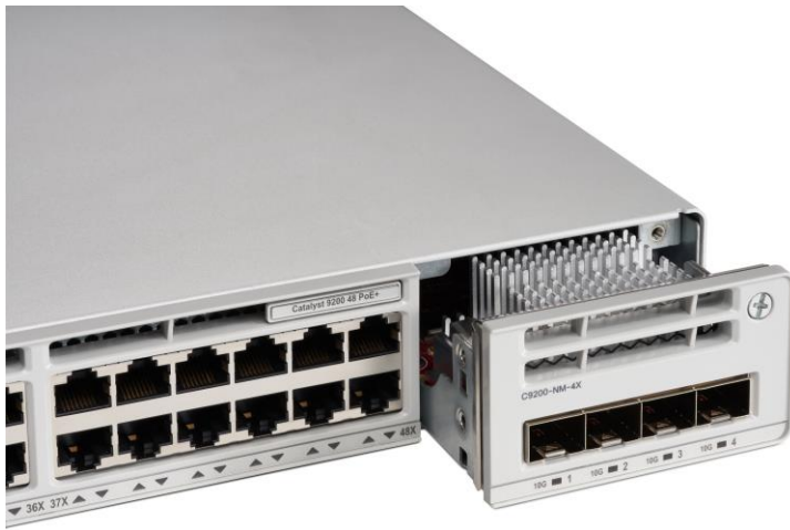
Figure 3. Cisco Catalyst 9200 Series Switch dual redundant power supplies

Table 4 lists the PoE+ power availability for each model.