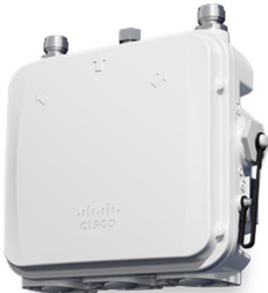
Figure 2. Catalyst IW9165D Heavy Duty Access Point

The Catalyst IW9165D is designed to make wireless backhaul deployment simple. It comes with a built-in directional antenna that enables long-range, high-throughput connectivity anywhere fiber is not an option, so you can create a fixed wireless infrastructure (point-to-point, point-to-multipoint, and mesh) as well as backhaul traffic from mobile devices along wayside or trackside deployments. The external antenna ports let you quickly extend your network to new places when needed and choose the right antenna based on the use cases and deployment architectures. With heavy-duty IP67 design, the Catalyst IW9165D is certified to operate under wet, dusty, and extreme temperature conditions.