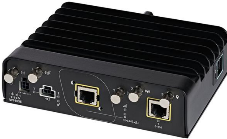
Figure 1. Catalyst IW9165E Rugged Access Point and Wireless Client